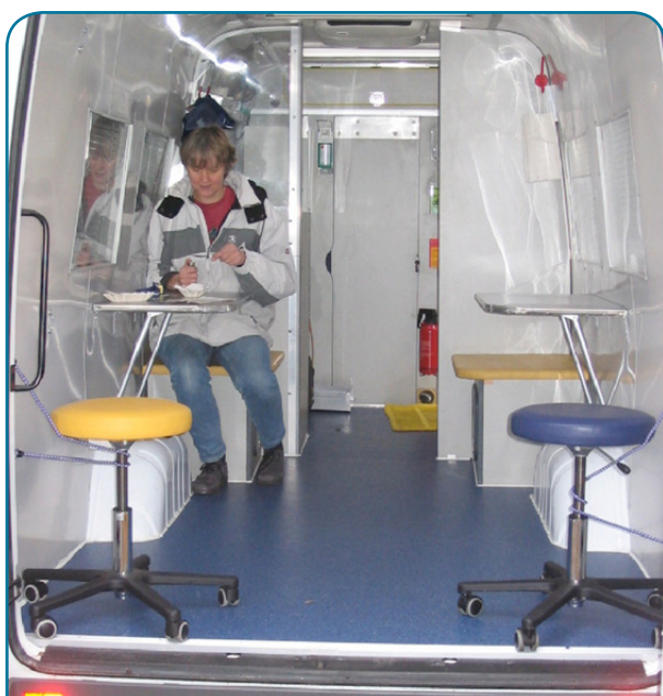
Pic 3 A look inside the mobile DCR Berlin

Clients of the mobile DCRs are registered after an initial assessment, which provides an opportunity for onward referral. Following registration there are no restrictions on access to the mobile DCR in Barcelona. However, in Berlin, PWID who are in opiate substitution treatment are not allowed to enter the mobile DCR. The general operating principles of the mobile DCR are consistent with fixed site DCRs. The major difference is throughput. With only 3 booths, mobile DCRs inevitably see less people per day than larger fixed-site services.