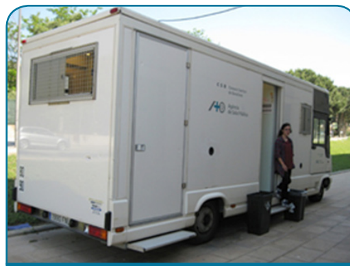
Pic 1 Mobile DCR in Barcelona

The mobile DCRs in Barcelona (Pics. 1 and 2) and Berlin are comprised of especially fitted-out vans that have three injection booths. While the van in Berlin does provide services in different locations, the Barcelona van is currently based in only one location, an industrial area that is a well-known location for the dealing, and use of illegal drugs.