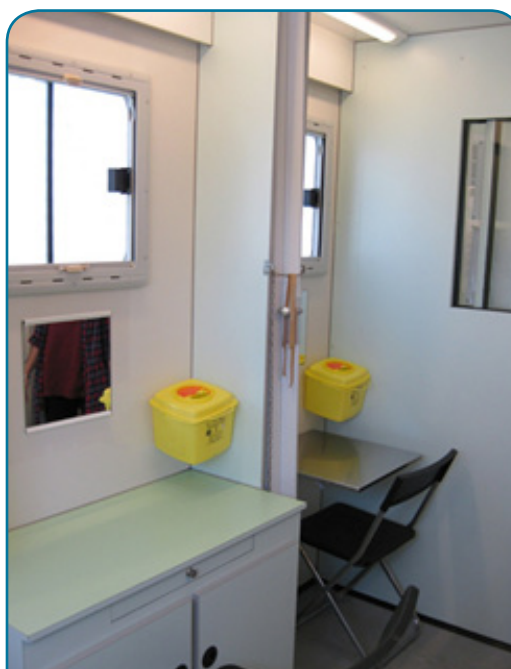
Pic. 2 Mobile DCR Barcelona