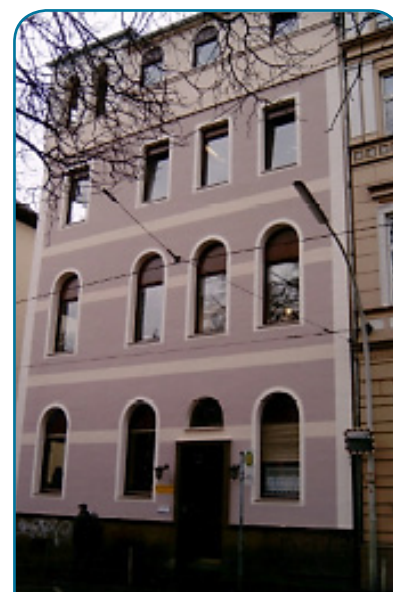
DCR Bonn, the integrated Model

Integrated facilities are the most common type. These DCRs are typically a part of a broader and interlinked network of services. Today DCRs are mostly based in drug service centres alongside a range of other services, such as counselling and testing for blood borne viruses, drop in centre (DIC) with needle and syringe programmes (NSP), psychosocial care, care for homeless people, medical services (e.g. wound care), and access to employment programmes. Usually the DCR is provided in a dedicated area of the service and the access is normally controlled by staff. This allows staff to limit the number of PWUD using the DCR at any one time and also to manage entry restrictions, most commonly to enforce a minimum age limit of 18 years and also to prevent those in opiate substitution treatment from entering the service (e.g. Germany).