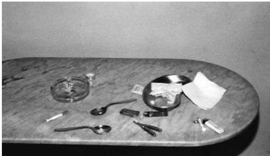
La Strada, Frankfurt a.M.