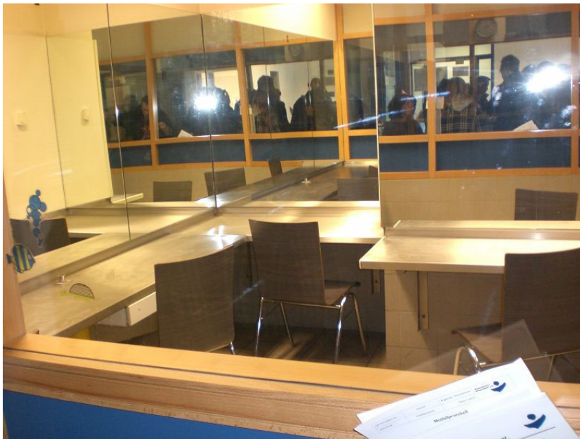
DKR Drogenhilfe DHZ Düsseldorf

TOX-IN - Tageszentrum 8, rte de Thionville; L-2610 Luxembourg Telefon: 0352-26 480 130; Fax: 0352-26 480 132 Email: tox-injour@cnds.lu ; www.cnds.lu