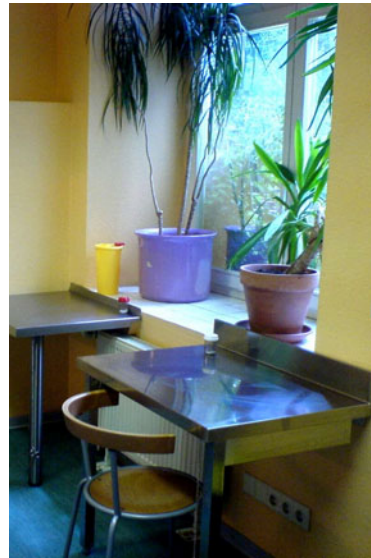
Gleis 1, Wuppertal