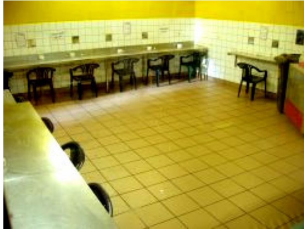
DKR Nidda 49, FFM