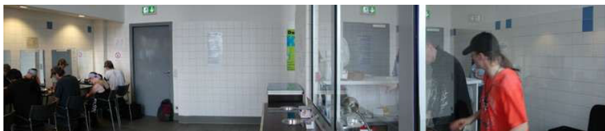
DKR Eastside – Frankfurt a.M.

Due to local public order partnerships, such facilities operate almost trouble-free and make a significant contribution to minimising harm and providing survival assistance for drug consumers. Given the appropriate opening hours, they significantly contribute to the relief of inner city problems with regard to open drug scenes and public drug consumption. The consistently positive conclusions that can be drawn from the perspective of the cities, operators and usage reports speak for expansion and continued development of the availability of drug consumption rooms.