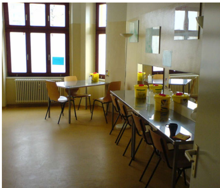
Birkenstube vista gmbH Berlin